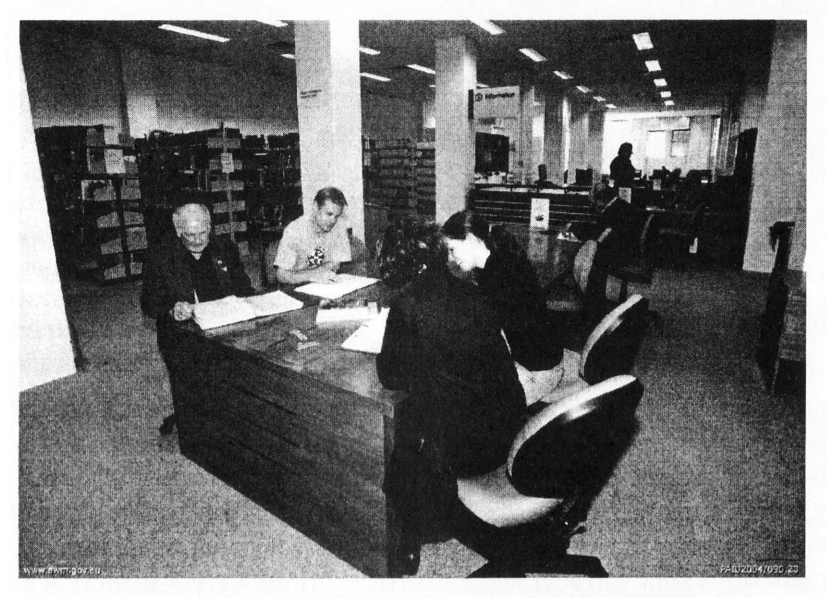
AWM reading room.