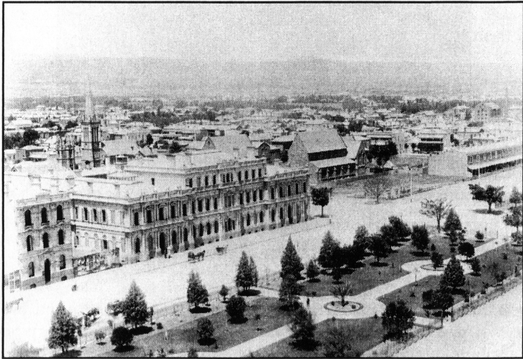
Adelaide from the Post Office Tower, ca 1887.