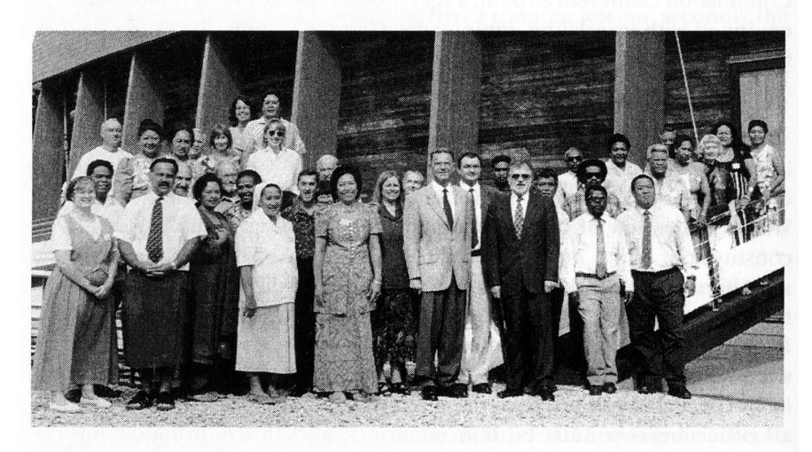
Delegates at the PARBICA 7 Conference, Noumea, New Caledonia, 21–28 August 1997

There was also a lot of discussion about cooperation with heritage minded organisations within the Pacific Region, particularly PIALA (Pacific Islands Archives and Library Association), which was seeking assistance for an upcoming conference to be held in Pohnpei, Federated States of Micronesia. Some members of PARBICA are members of PIALA and other similar organisations. It was pointed out that PIALA is mainly made up of librarians, though its membership includes archivists and museum curators. PIALA is