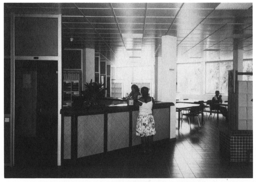
Polynesian Archives Service Building, reception area.