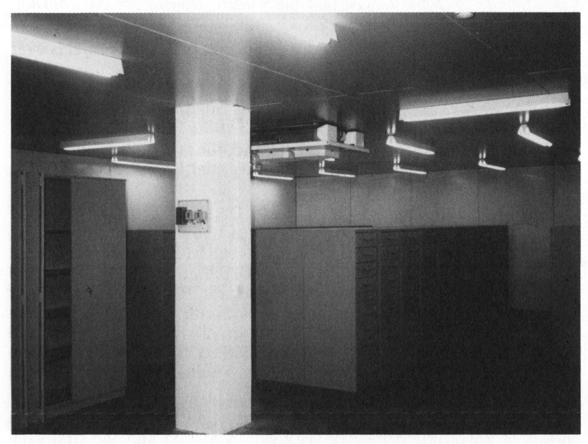
Polynesian Archives Service Building, stack area.