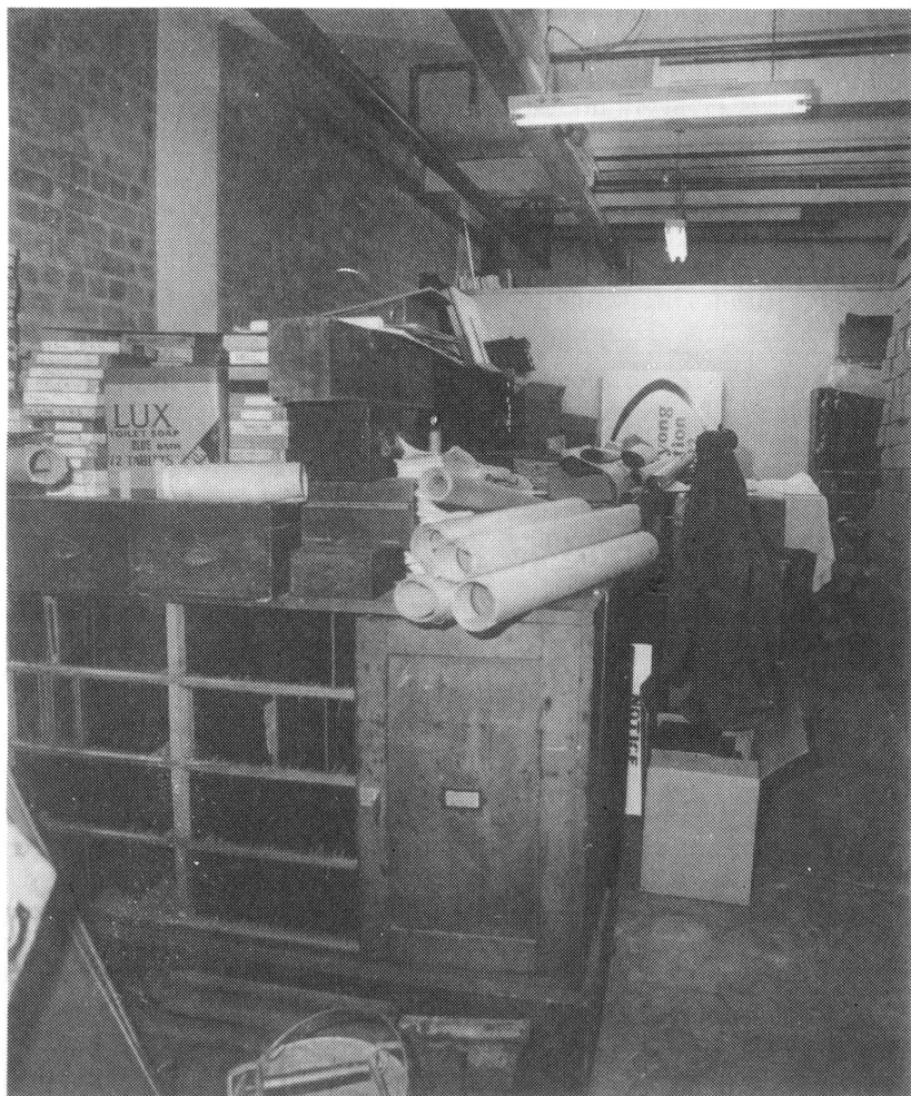
Secondary storage area.

Section. In this connection, the General Records Disposal Schedule issued by the Archives Authority has been invaluable.