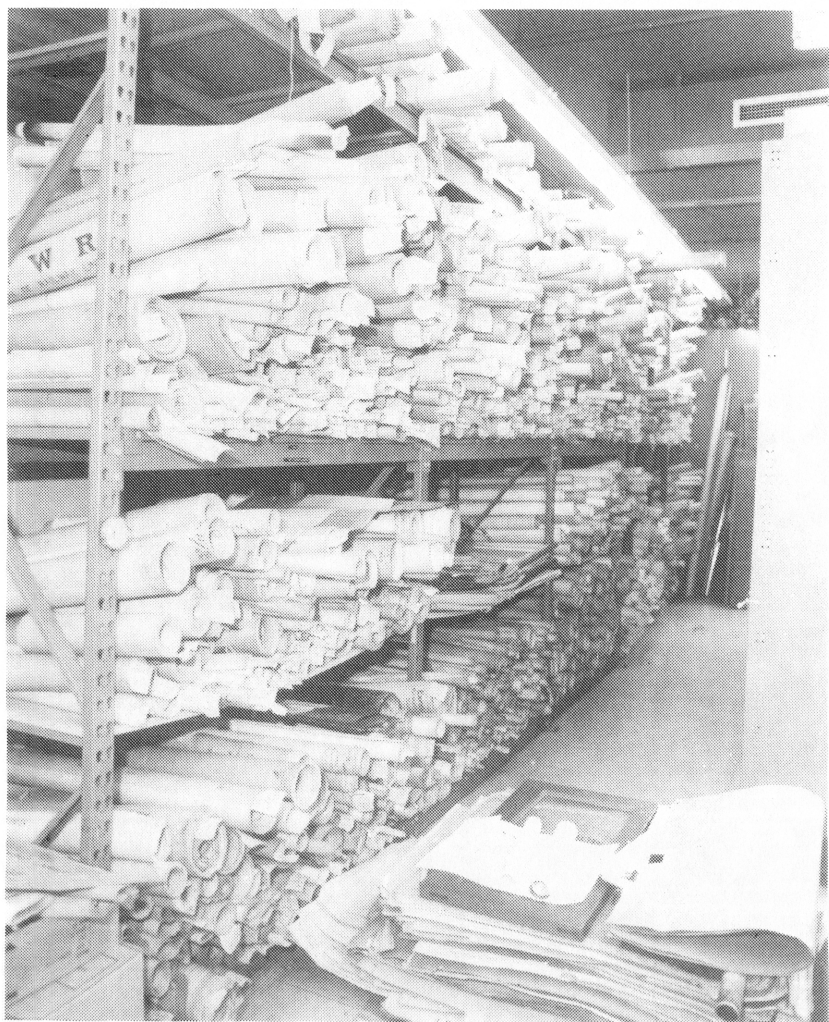
Part of plans storage.