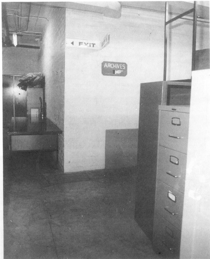
Public entrance to Archives Section.