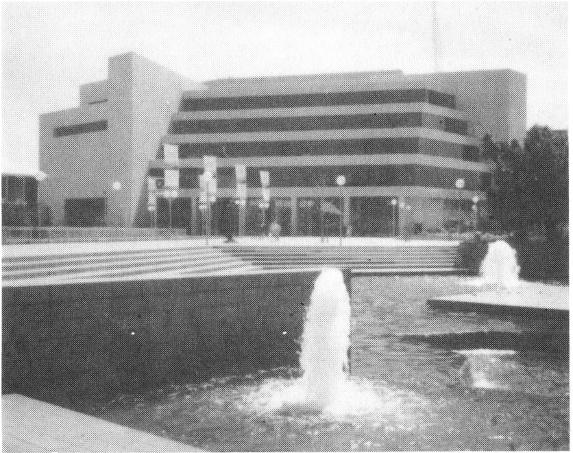
Alexander Library Building.

staff went through interrogation sessions with an officer from that Department.