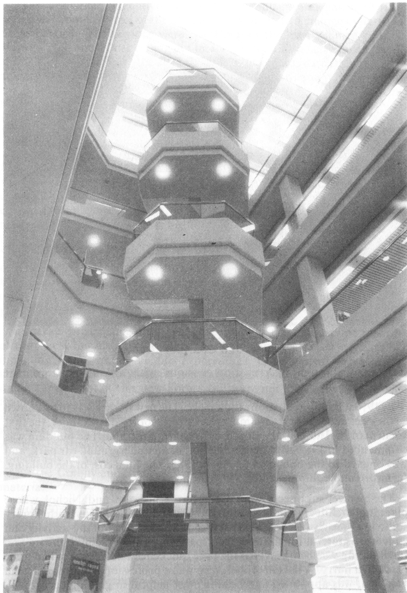
Alexander Library Building. Sculptured staircase.