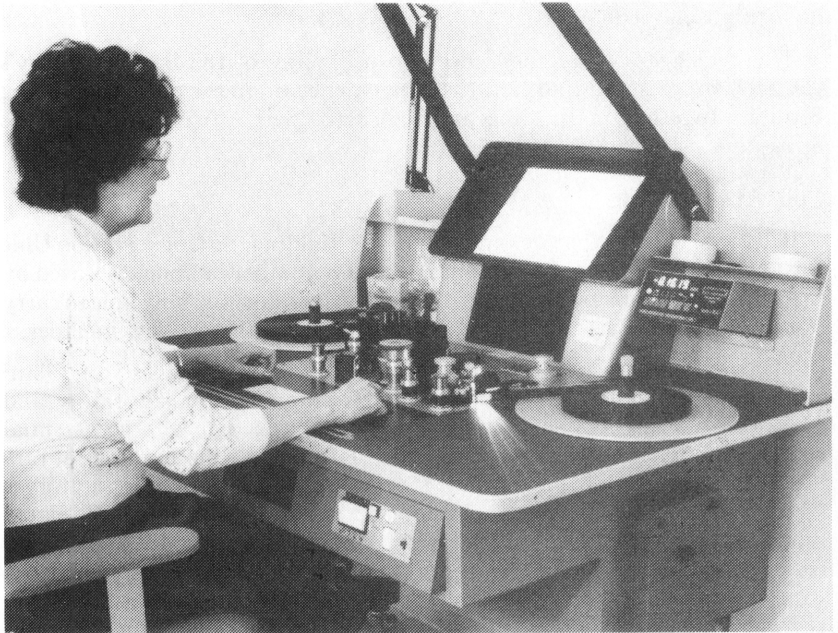
State Film Archives. Intercine. Courtesy Library Board of Western Australia.