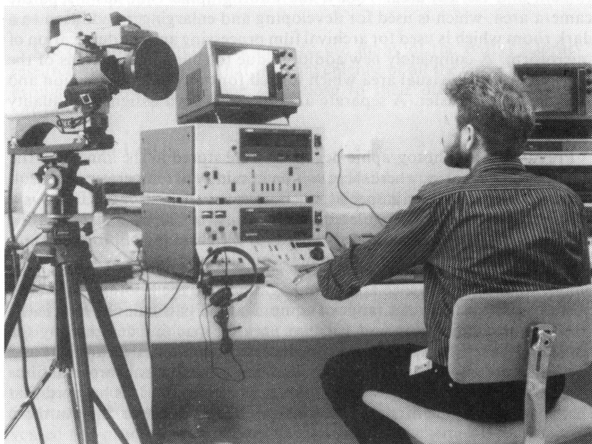
Video equipment in Photographics.