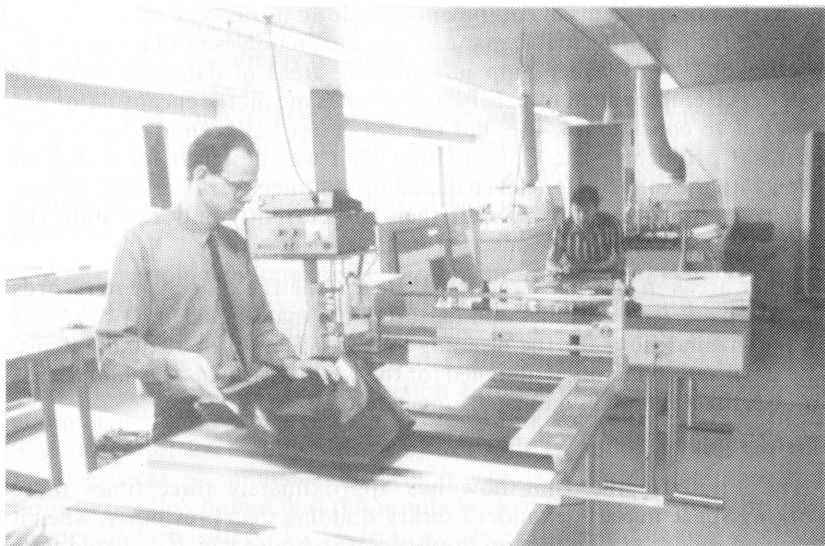
Conservation Laboratory.