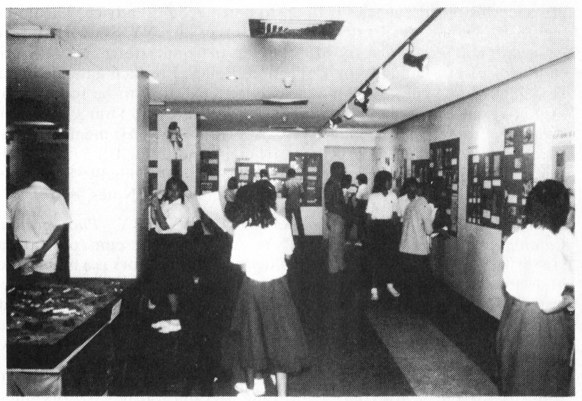
Exhibition Hall, Hill Street Building.