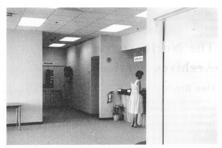
Foyer and exhibition area. The main entrance is off-camera to the left. Centrally located, this gives access to the Lending Service counter, Search Room and general offices.