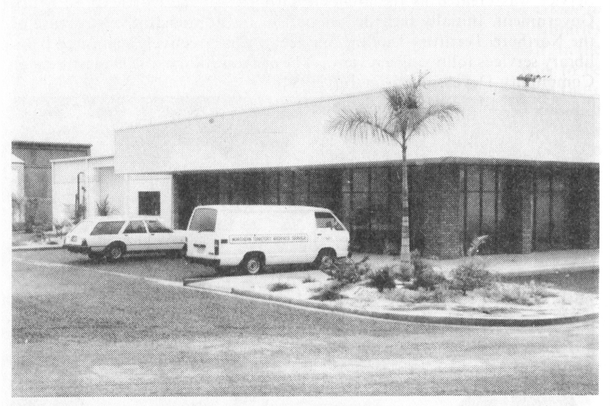
The interim Archives building at McMinn Street has off-street parking and loading bay facilities at the front and rear.