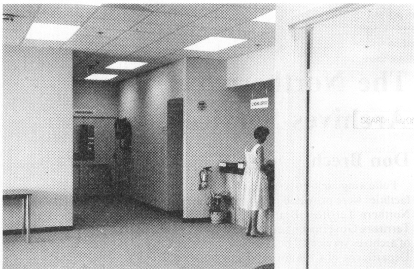
Foyer and exhibition area. The main entrance is off-camera to the left. Centrally located, this gives access to the Lending Service counter, Search Room and general offices.