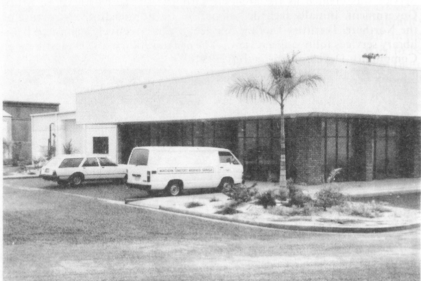
The interim Archives building at McMinn Street has off-street parking and loading bay facilities at the front and rear.