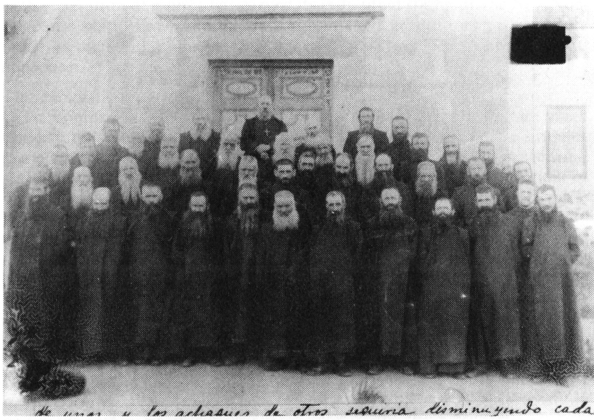
de un... y los achasus de otros seoria disminuyendo cada Monks at the Benedictine Monastery 1880.