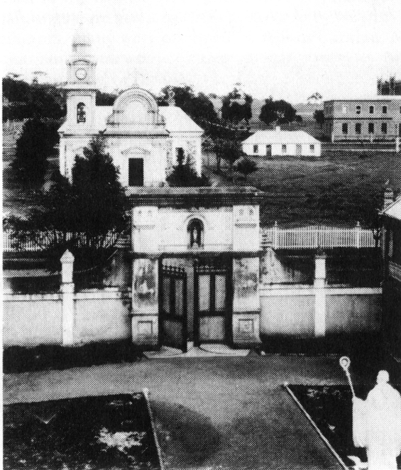
View from the Monastery cloister looking towards the Mission Church, c. 1924.