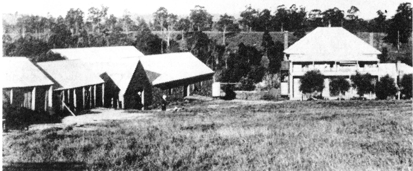
Cawarra, the homestead and winery c.1900.