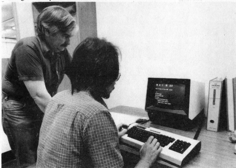
Technocracy, wizardry: the Joint Schools' computer at the Coombs Building is available on tap [&*@%/$ illegal command], and it is used daily — to update our oft-published List of holdings , to supervise access arrangements with readers, or to develop a map catalogue.