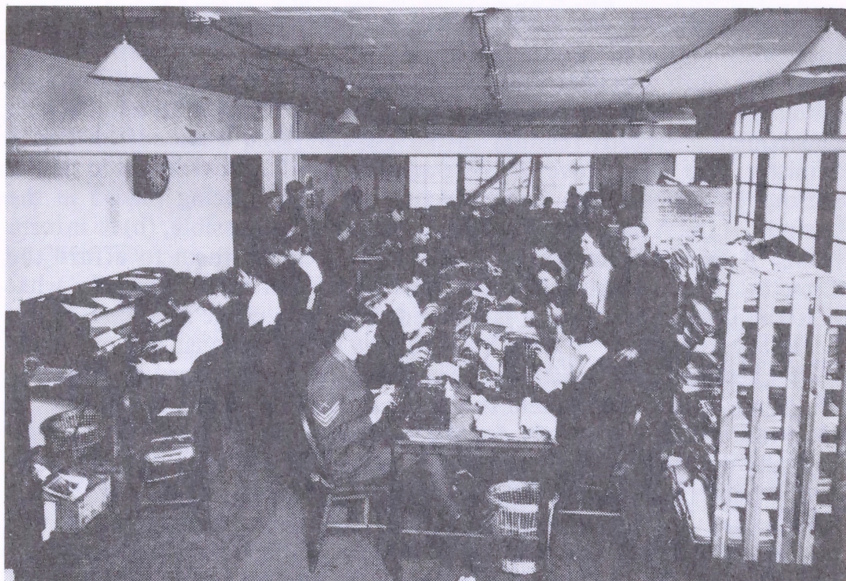
Typists at work on the precis of war diaries