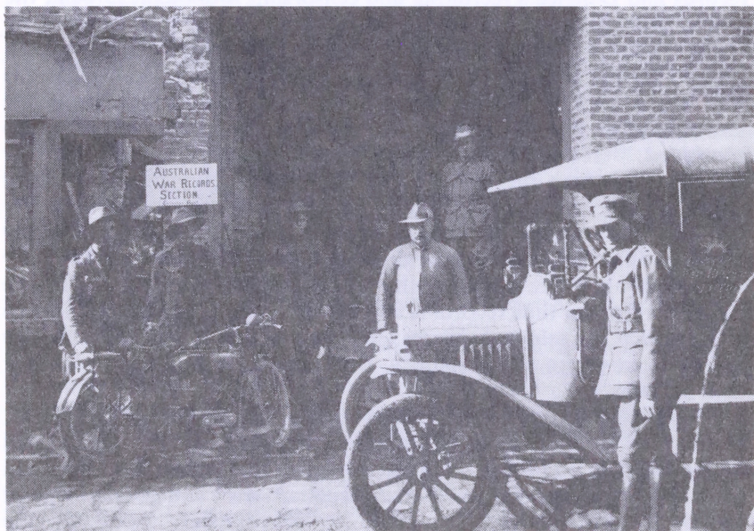
An Australian War Records Section trophy collecting depot in Peronne, Sept-Oct 1918