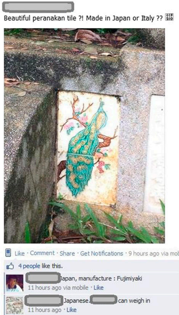
Figure 3. A record of participation in building knowledge.

has gained pace especially in the contemporary context, with the pressures of globalisation also quickly introducing changes in the ways people connect with each other, think about their heritage and clear lands (which may have cultural value) to make way for industrialisation. These changes culminate in the persistent need for documentation and archival work. Archiving in such contexts requires new facilitation skills, updated knowledge about the latest technologies and innovations, and constant sensitivities towards target users.