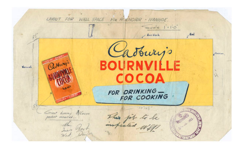
Figure 1. Layout for wall space, Ivanhoe, R Knorr, 9 February 1955.

A grant from a local foundation provided limited resources to undertake the technical development and refinement, and the scanning and uploading work. However this funding did not cover detailed checking and proofreading, nor the inclusion of detailed metadata beyond basic job and geolocation details (something that Omeka is designed to support). A project decision was made early to privilege comprehensiveness of uploaded content over comprehensiveness of metadata, with a view towards seeking additional support later to undertake finessing.