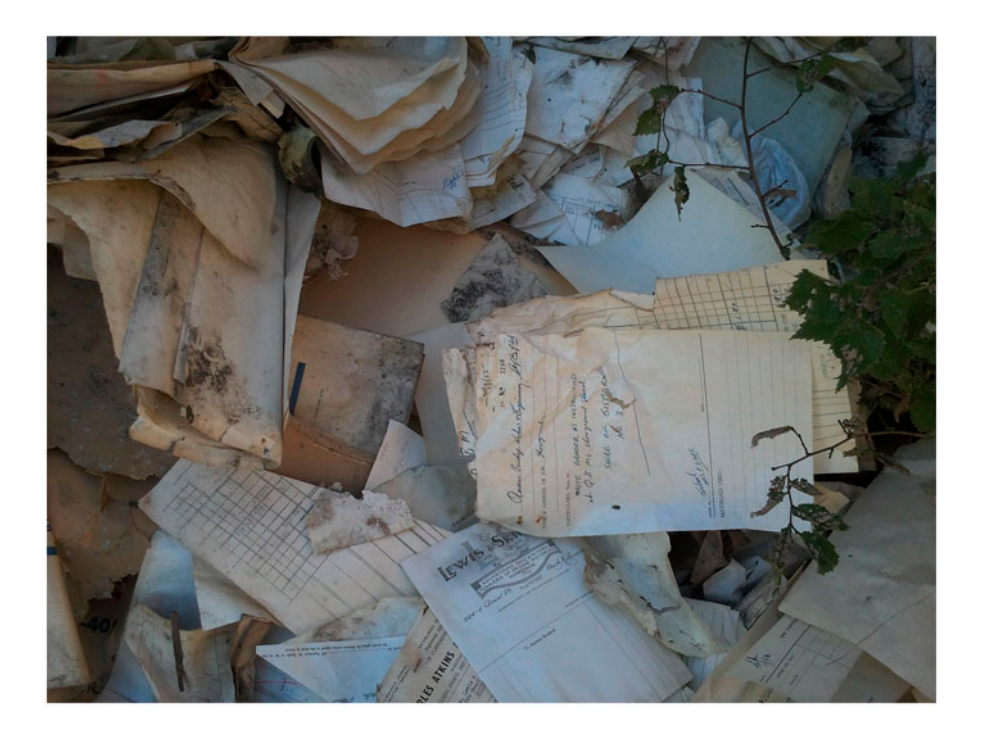
Figure 3. Detail of found records of Lewis & Skinner, 2012.