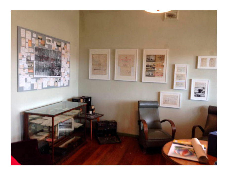
Figure 4. Partial view of the Lewis & Skinner exhibition in Seddon, 2013, image by Stefan Schutt.

During that week, a large Lewis & Skinner logo was progressively painted as a mural on the wall of the cafe by a local sign-painting artisan, with other sign painters joining in to help (Figure 5).