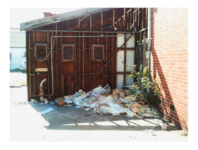
Figure 2. The 'find' records of Lewis & Skinner in situ at the Footscray demolition site, 2012, image by Stefan Schutt.