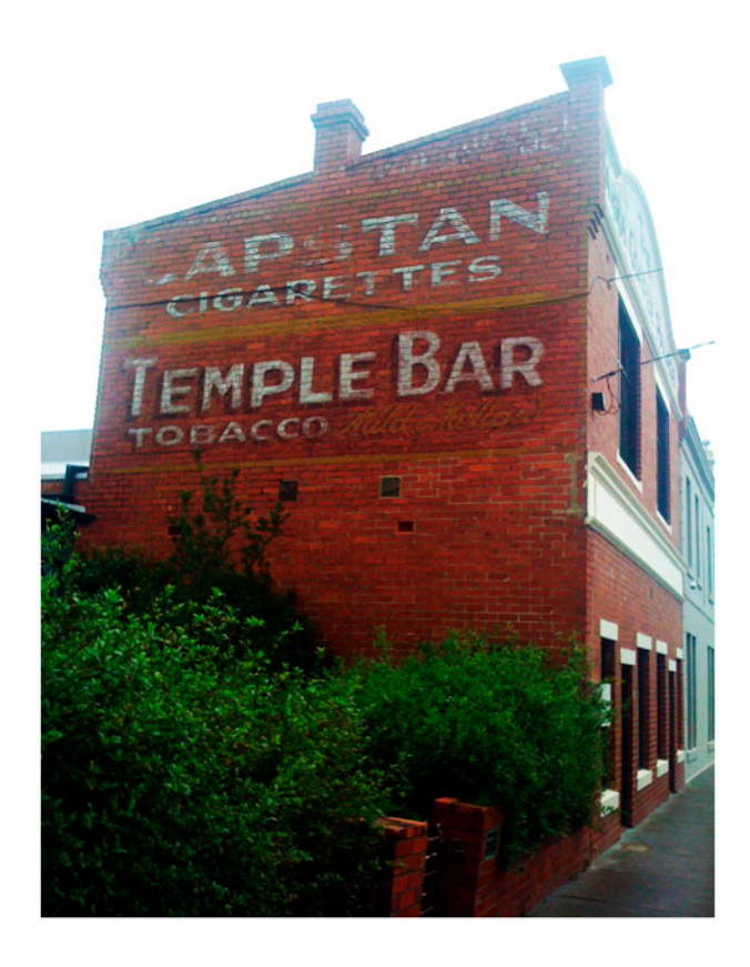
Figure 7. An example of a ghost sign – Capstan Cigarettes/Temple Bar Tobacco located in Yarraville, Melbourne, 2013, image by Stefan Schutt from his blog, available at http://findingtheradiobook.blogspot.com.au/2012/11/another-beauty-from-yarraville-plus.html, accessed 28 November 2013.