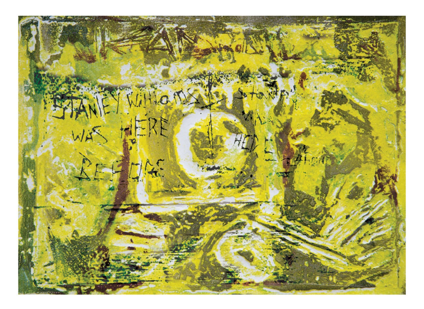
Figure 2. Sandie Jessamine, collagraph print 32.5 x 23.4, Living Traces 2016; photo Lily Hibberd.

Urban Transformation, the question as to how the former institution will be utilised in the future remains unknown.