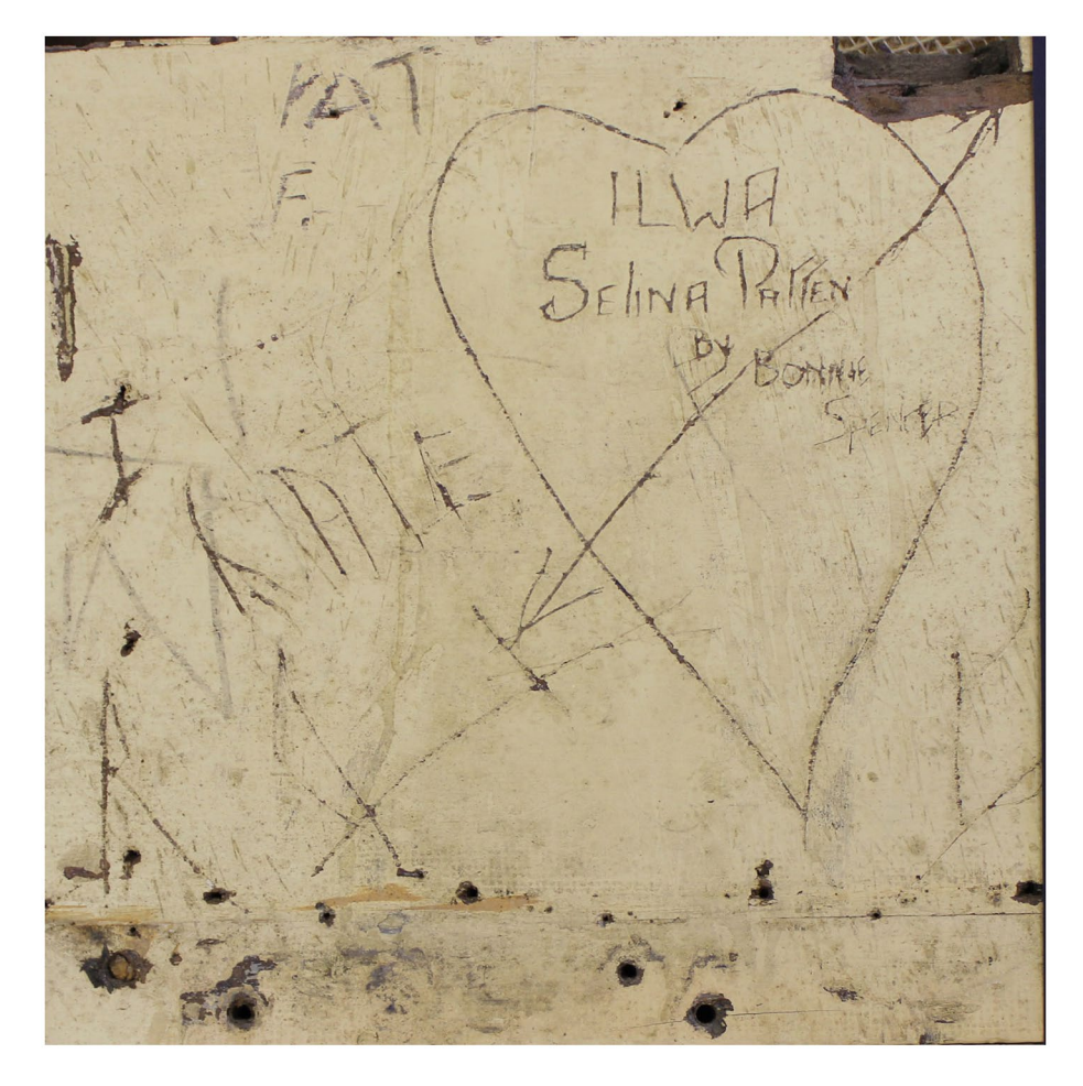
Figure 5. Graffiti on segregation room door, Parramatta Girls Home; photo Bonney Djuric.

of institutional 'graffiti' in documenting the institutional experience, and affirm the memory of former residents that indeed they were here and these things did happen to them, especially where no other 'evidence' of their time in an institution has been preserved.