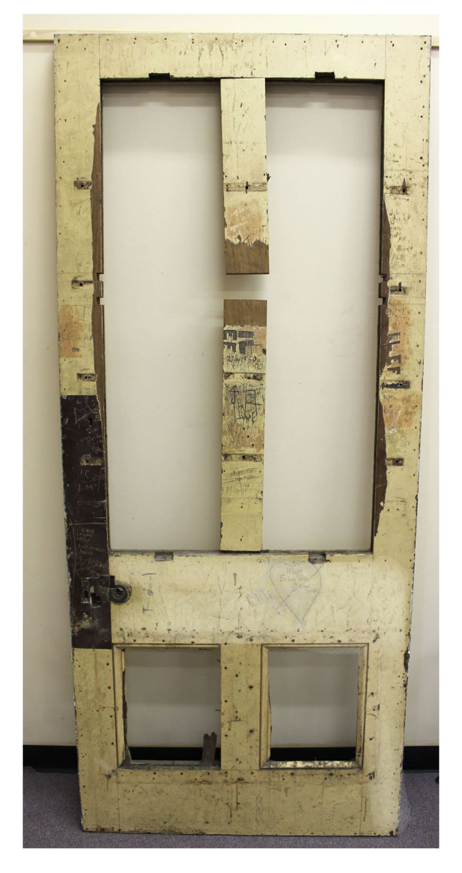
Figure 4. Segregation room door, Parramatta Girls Home; photo Bonney Djuric.

Today, graffiti at Parramatta Girls Home is only evident to former residents. Words and acronyms written in coded language 'ILWA' (I Love Worship Always) remain as a bond of friendship between them. Living Traces captures these unrecorded memories of the institution, buried under trauma and shame, that would be otherwise lost forever.