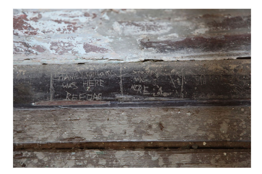
Figure 3. Graffiti in segregation room, Parramatta Girls Home.

connection with a site can engage in the memorialisation of that site and determine how they want to be remembered.