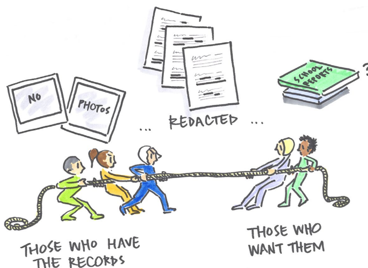
Figure 1. One of the most popular illustrations from the graphic note-taking at the Summit by Matthew Magain from Sketch Group.