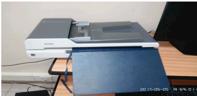
Figure 1. Size and capacity of EPSON GT-1500 scanner used for digitisation.

One of the key determinants of institutional readiness towards digital archives management is proper description of digital archives, therefore the elements should be well integrated with the digital archives management software.