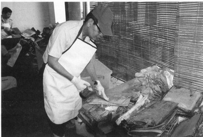
Rescuing records after the Situ Gintung dam burst

Social responsibility has been getting major attention from ANRI with a number of disasters that have occurred in recent years in Indonesia. The tsunami in Aceh was a starting point for ANRI to provide a reaction to disasters. At that time huge numbers of archives, especially land registers, were saved by ANRI. The Situ Gintung dam burst south of Jakarta in March 2009 was the most recent reaction work undertaken by ANRI.