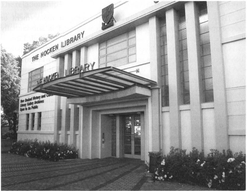
The Hocken Library today