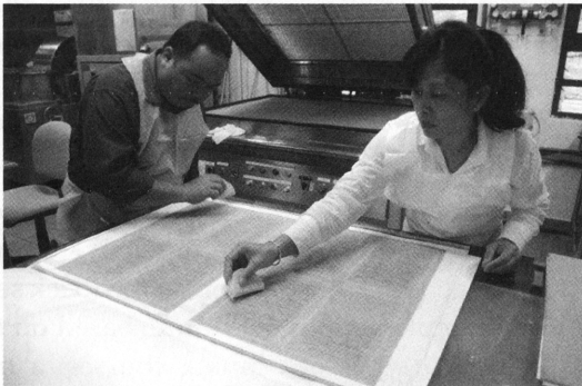
Participants trying their hand at cleaning excess fibre from documents after leafcasting process at NAS's Archives Conservation Lab

In March this year, seventeen archivists and two librarians from nine ASEAN countries were in Singapore for a two-week Workshop on Preservation of Recorded Heritage, jointly conducted by NAS, the State Archives Administration of China (SAAC) and Renmin University of China. Jointly sponsored by Singapore's foreign affairs ministry and China's commerce ministry, under the Singapore–China Third Country Training Programme, the workshop's main objective was to provide participants with an overview of the whole spectrum of archives management work. The comprehensive range of topics covered included records management, preservation imaging, conservation principles and techniques, audiovisual archives management, oral history methodology, archives repository management, disaster recovery and preparedness, and archives dissemination and deployment.