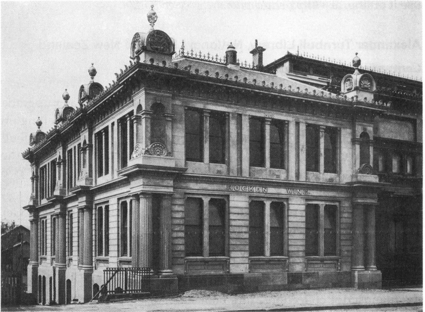
The Hocken Library in 1910

This year we celebrated the centenary of the opening of the Hocken Collections in 1910.