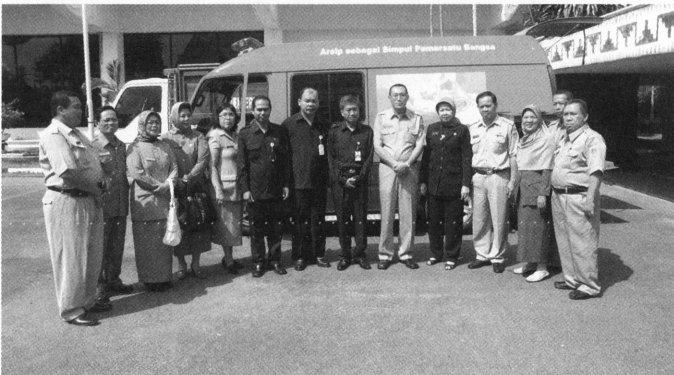
Handover of an Archives Awareness Vehicle

Our programs in the last year aimed to re-introduce and promote archival matters to all societies across the country. One of the tools used by ANRI was Archives Awareness Vehicles ( Mobil Sadar Arsip ). Vehicles will be sent to every province in Indonesia. Up to the end of 2009, ANRI had given a vehicle to seven big provinces and this will now be continued in other provinces.