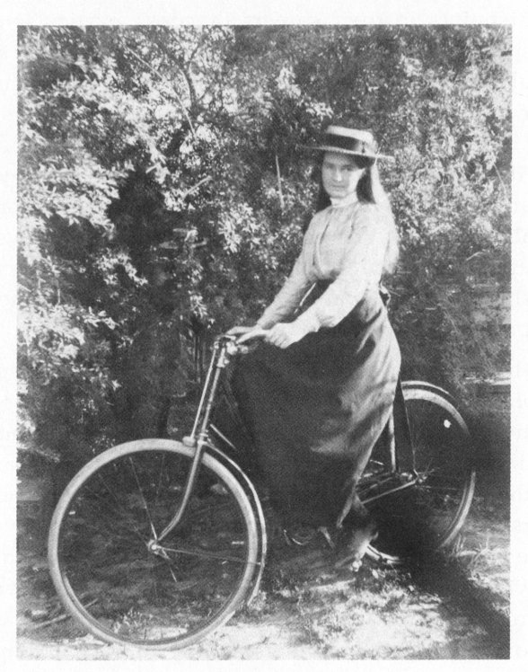
Unknown photographer, Nettie Palmer on a Bicycle at Elsternwick, Victoria, 1902, sepia-toned photograph; 10.0 x 7.3 cm. Pictures Collection, National Library of Australia, nla.pic-vn4239300

A specific photograph, in effect, is never distinguished from its referent (from what it represents), or at least it is not immediately or generally distinguished from its referent ... It is as if the photograph always carries its referent with itself.<sup>116</sup>