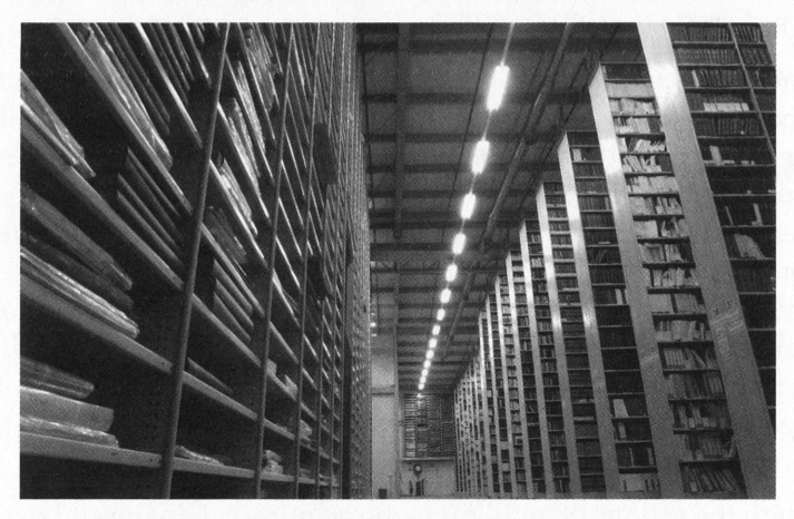
Louis Seselja (b. 1948), The stacks at Hume Warehouse, annex of the National Library of Australia, Canberra, 2005. Pictures Collection, National Library of Australia, nla.int-nl39436-ls46

It is only after a fond has been created through these processes that the researcher enters the reading room and begins to read: sifting, transcribing, interpreting and analysing – in other words, shaping the archive in our own image and according to our own research priorities. But that shaping is also potentially productive, if not revelatory, for it is the professional researcher, together with the archivist and the librarian, who 'create the maps and record the journeys into the archive that produce the images we have of the possibilities of the material'.<sup>59</sup>