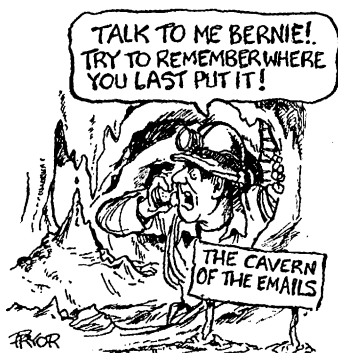
The cavern of the emails

As a first step in updating these valuable resources, a revised booklet has been produced. The new content better reflects the nature of contemporary records management, especially in the digital environment.